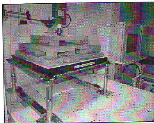
TEST UNDER PROGRESS