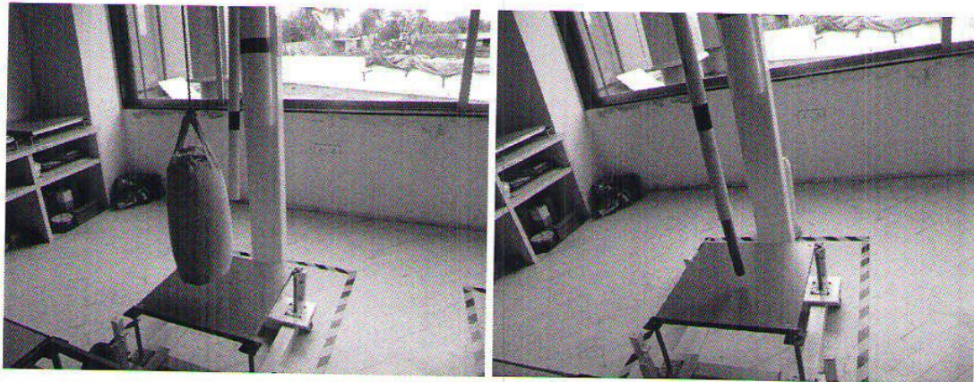
UNITILE UFP 30 1650 Bare - TEST UNDER PROGRESS